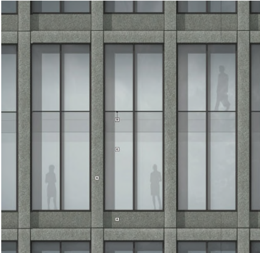
Typical bay detail

The colour of the façade reflects its context and the language found in the wider NOMA estate particularly around Sadler's Yard. The darker colour proposed would accentuate the grid format particularly the predominant glass façade of the building.