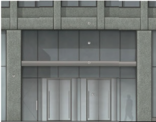
Miller Street main entrance

The main entrance on Miller Street is recessed across 3 bays and measures approximately 1.7 m deep by 8 m wide by 6.4 m high. A solid canopy projects beyond the building line.