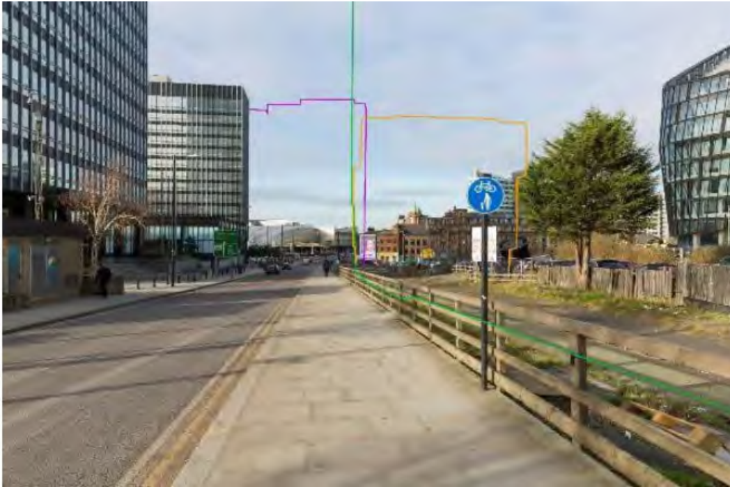
View 5 – view from Miller Street

View 6 – is from the junction of Dantzig Street and Angel Street, looking towards the site. The view contains a number of listed buildings (New Century Hall, Old Bank and Parkers Hotel) but these are on the margins of the view which is dominated by the car park. Number 1 Angel Square is to the left of the view.