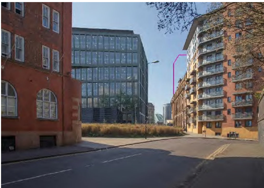
View 3 – view from Aspin Lane

The proposal would dominate the view, but the Old Bank Building is legible with the more modern buildings. New Century Hall would no longer be seen and the existing buildings would be removed from the site. The development would have a positive impact as its scale complements the surrounding development and the view appears more cohesive. Its fenestration complements surrounding built form. The removal of a partially vacant site from this view would have a minor beneficial impact on Ashton House.