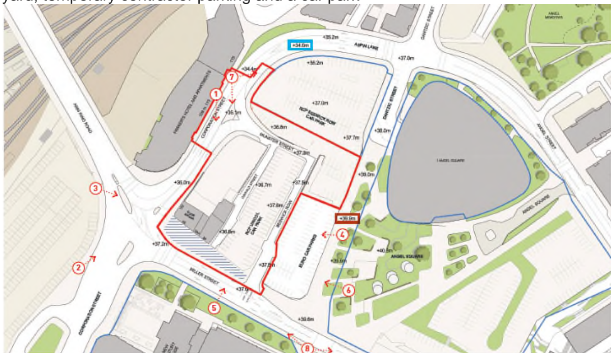
Extent of the application site including layout and uses

The site is 0.68 ha, rectangular and bounded by Miller Street, Rochdale Road/A664 Ring Road, Munster Street and Beswick Row/Dantzig Street. It comprises two vacant industrial buildings of varying heights and the former Ducie Bridge public house which all front on to Miller Street. A hardstanding to the rear is used as a storage yard, temporary contractor parking and a car park