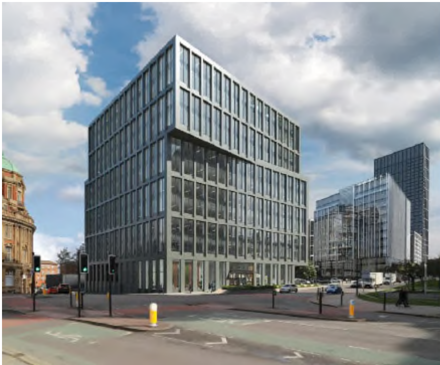
Indicative view of the proposal corner of Miller Street/Corporation Street

It will be necessary to provide a new primary substation on a site directly to the north of this site to facilitate future development at NOMA. This is the subject of planning application (123438/FO/2019). This is a critical piece of infrastructure that would be delivered as a standalone development.