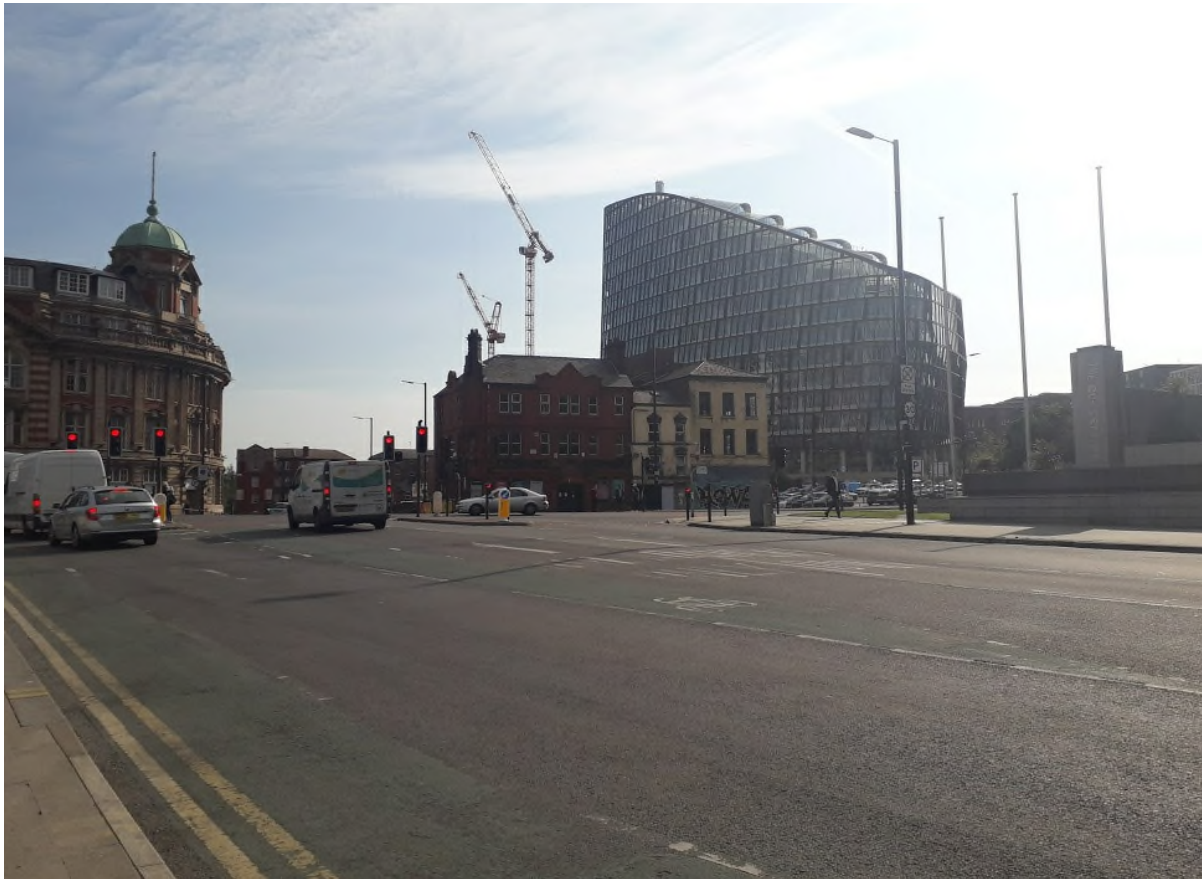
Existing view of the site and buildings with 1 Angel Square and Parkers Hotel in view

drop of 1 metre occurs on the bend in the ring road where Corporation Street meets Aspin Lane. The highest part is at the eastern point where it interfaces with Angel Square. The difference in level is around 4.5 metres, which equates to a large storey height. There is a vehicular access from Miller Street via Beswick Row, which becomes one-way and connects to Munster Street and Oswald Street, which runs north to south through the Site.