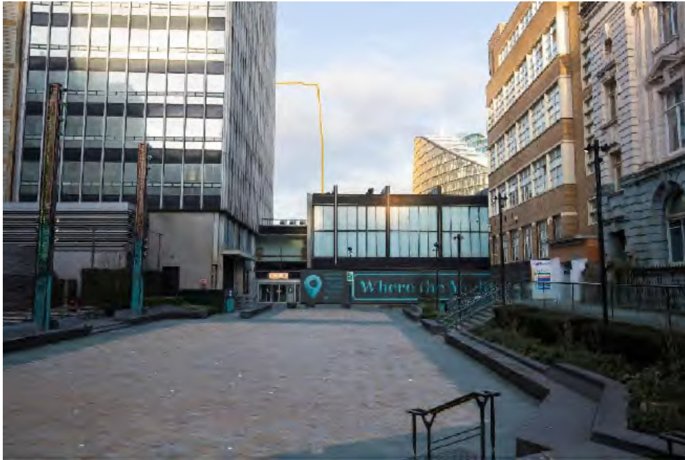
View 4 – view from Sadlers Yard

View 5 – is from Miller Street looking west. The view is dominated by the CIS and New Century House towers and New Century Hall. Number 1 Angel Square can be seen to the right and Parkers Hotel and the new roof to Victoria Train station are visible.