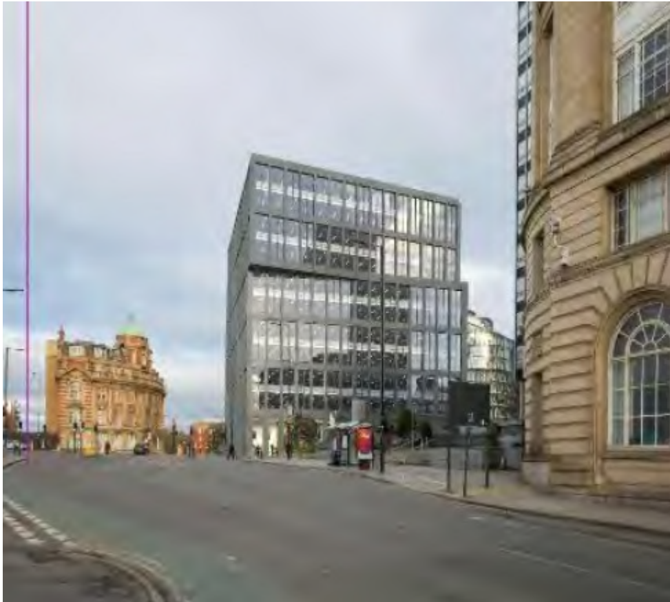
View 1 – west side of Corporation Street

View 2 – is experienced from the south side of Cheetham Hill Road. The view is dominated by the rear of the Grade II listed Parker Hotel with the grade II CIS tower and Grade II New Century House to the right. The upper section of 1 Angel Square is visible. Cheetham Hill Road also dominates with the 19 th century Bridge across the railway and tram lines.