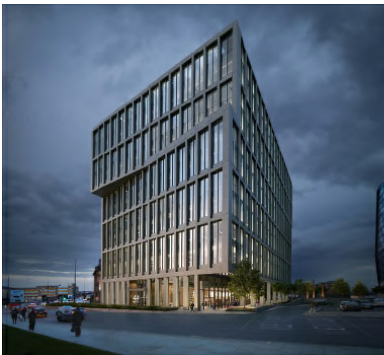
View from Miller Street looking north west

The colour of the façade reflects its context and the language found in the wider NOMA estate particularly around Sadler's Yard. The darker colour proposed would accentuate the grid format particularly the predominant glass façade of the building.